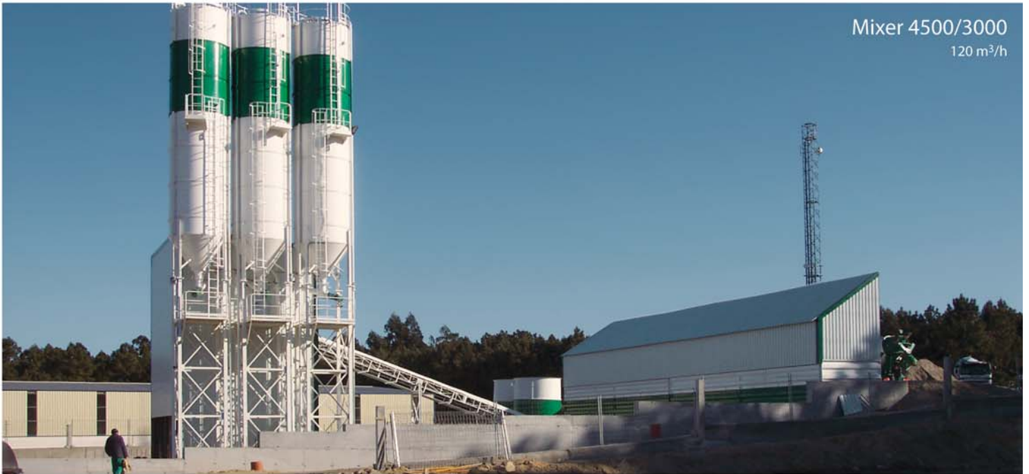
Mixer 4500/3000 120 m 3 /h