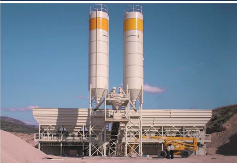
Mixer 1500/1000 40 m 3 /h