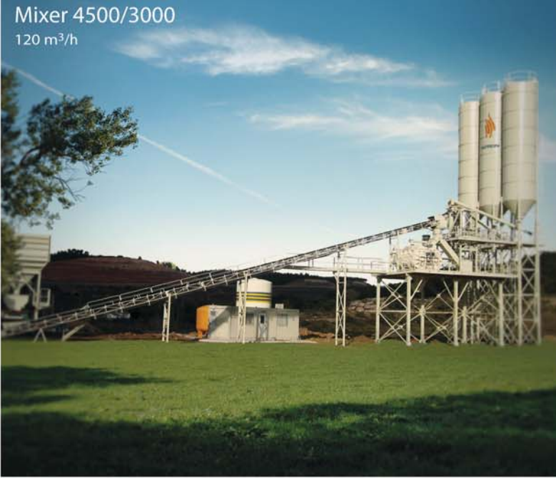
Mixer 4500/3000 120 m 3 /h