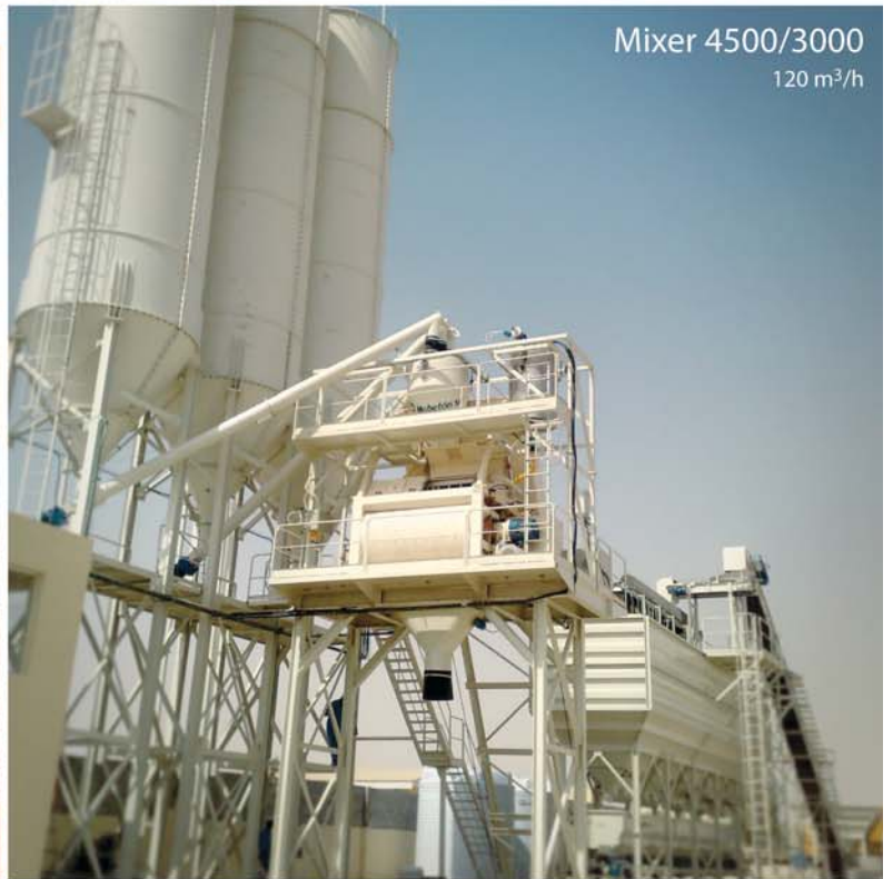
Mixer 4500/3000 120 m 3 /h